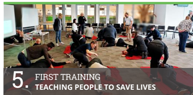
5. FIRST TRAINING TEACHING PEOPLE TO SAVE LIVES