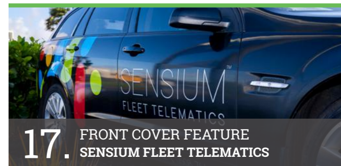
17. FRONT COVER FEATURE SENSIMUM FLEET TELEMATICS