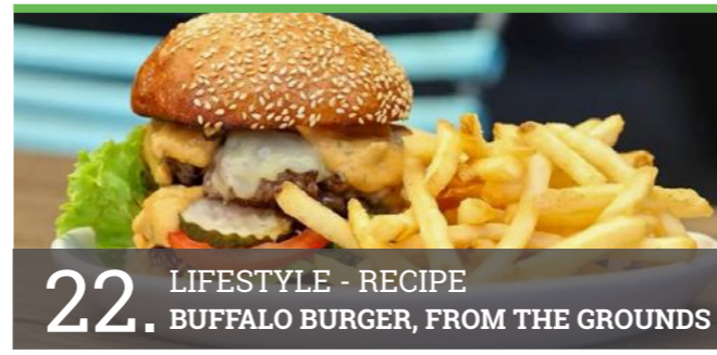
22. LIFESTYLE - RECIPE BUFFALO BURGER, FROM THE GROUNDS