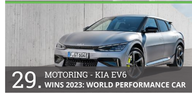
29. MOTORING - KIA EV6 WINS 2023: WORLD PERFORMANCE CAR