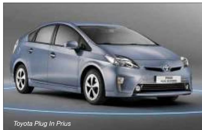
Toyota Plug In Prius